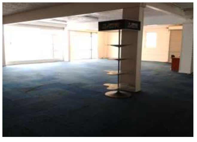
Ground Floor Unit 1 Exhibition Way, Exeter, Devon EX4 8JD